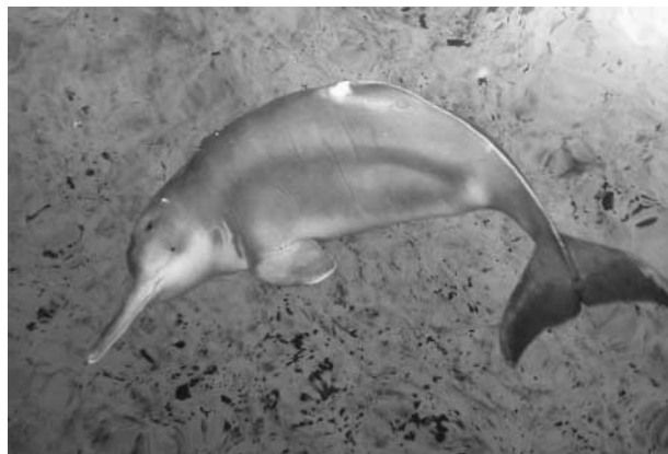
Figure 1. Yangtze River dolphin or baiji ( Lipotes vexillifer ). Male individual ('Qi Qi'), held at the Wuhan dolphinarium from 1980 to 2002.

The baiji is the only recent representative of the Lipotidae, a clade that diverged from other cetacean lineages more than 20 Myr ago (Nikaido et al. 2001). Its extinction represents the loss of a disproportionately large amount of mammalian evolutionary history (Isaac et al. 2007), and only the fourth disappearance of an entire mammal family since AD 1500 (MacPhee & Flemming 1999). It also represents the first documented global extinction of a 'mega-faunal' (greater than 100 kg) vertebrate for over 50 years, since the disappearance of the Caribbean monk seal ( Monachus tropicalis ) in the 1950s (MacPhee & Flemming 1999), and the first such species extinction since the emergence of an international network of